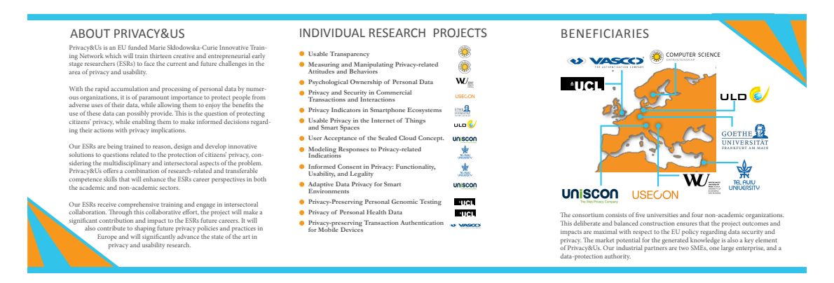
Figure 4: The Privacy&Us flyer. Back.