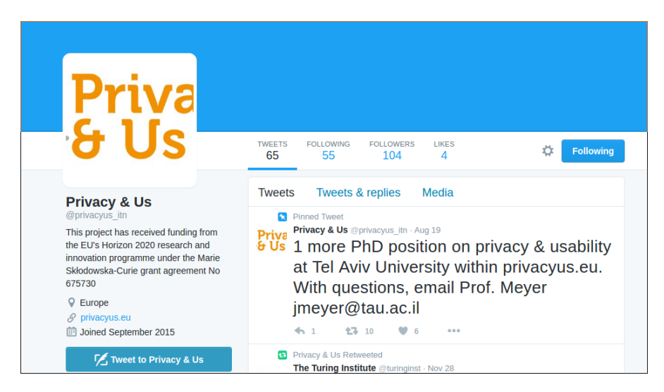
Figure 2: The Privacy&Us Twitter page (https://twitter.com/privacyus_itn).

The Privacy&Us's Twitter profile is available at https://twitter.com/privacyus_itn. The Twitter page is depicted in Figure 2.